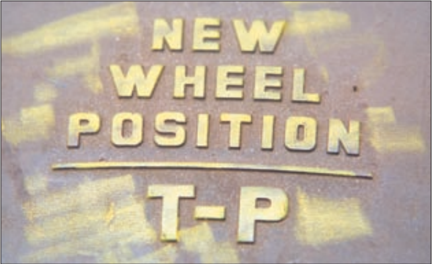
This tire is designated for use in trailer and piggyback operations.

In my opinion, the more clear, precise and understandable the information is on a tire sidewall, the better off everyone will be. Now, if we could just teach consumers to understand that if one tire sidewall bulges a lot more than the rest, the tire is probably low on air pressure. Better yet, let's teach them how and when to use a pressure gauge. ■