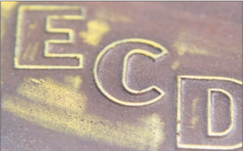
"ECD" indicates Goodyear's Enhanced Casing Design with a rustproof polyimide breaker ply in the belt package.