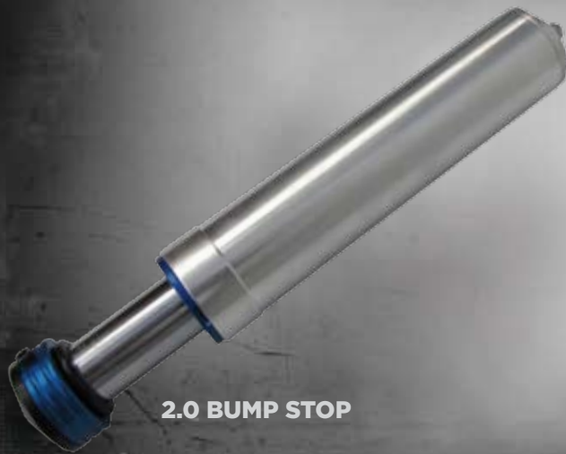
2.0 BUMP STOP