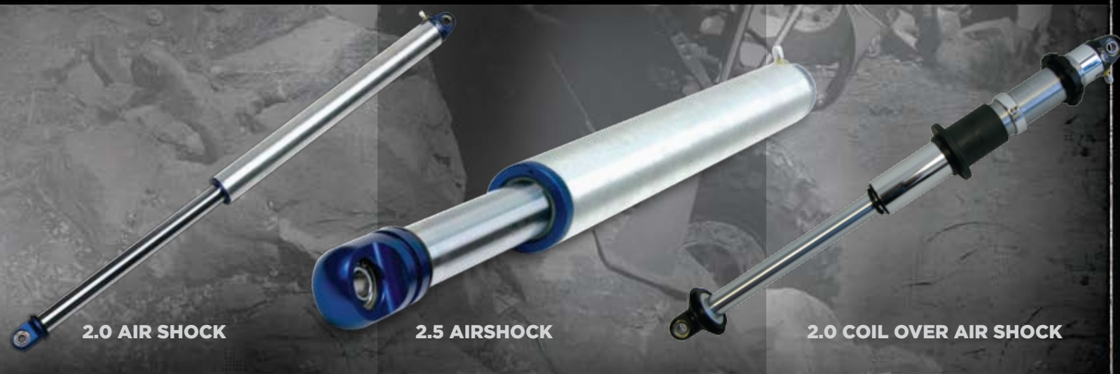
2.0 AIR SHOCK