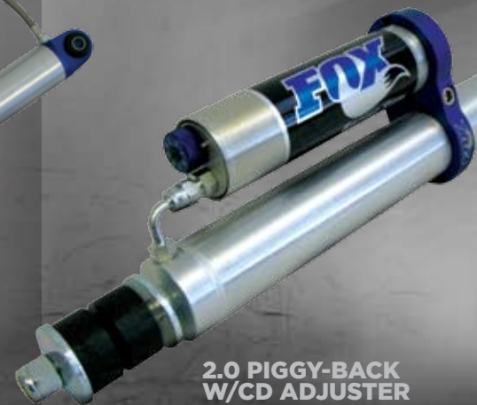
2.0 PIGGY-BACK W/CD ADJUSTER

SEE APPLICATION GUIDE FOR SPECIFIC FIT, MOUNTING AND SPECIFICATIONS.