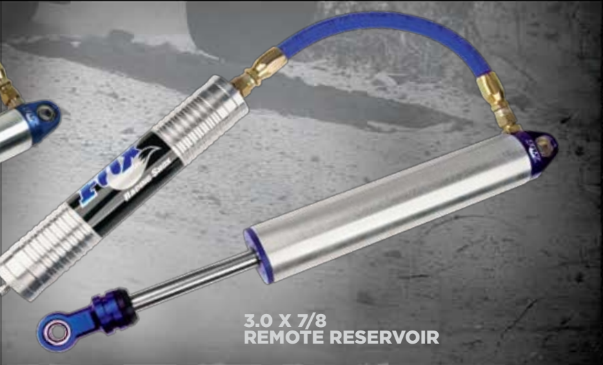
3.0 X 7/8 REMOTE RESERVOIR