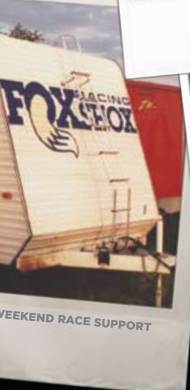
WEEKEND RACE SUPPORT