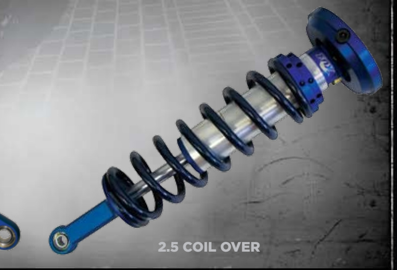
2.5 COIL OVER