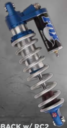
2.0 PIGGY-BACK w/ RC2

SEE APPLICATION GUIDE FOR SPECIFIC FIT, MOUNTING AND SPECIFICATIONS.