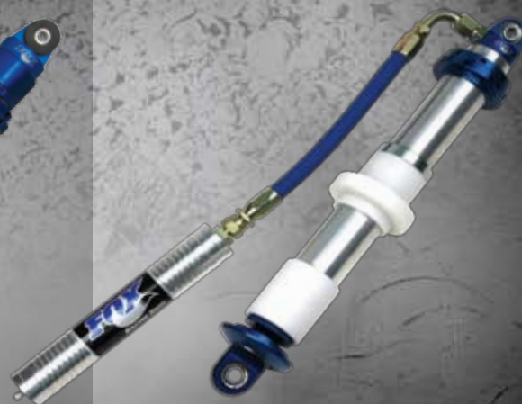
3.0 X 1.0 REMOTE RESERVOIR