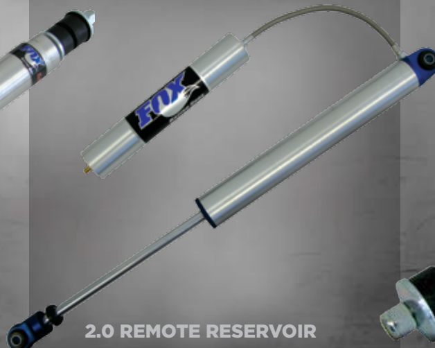
2.0 REMOTE RESERVOIR