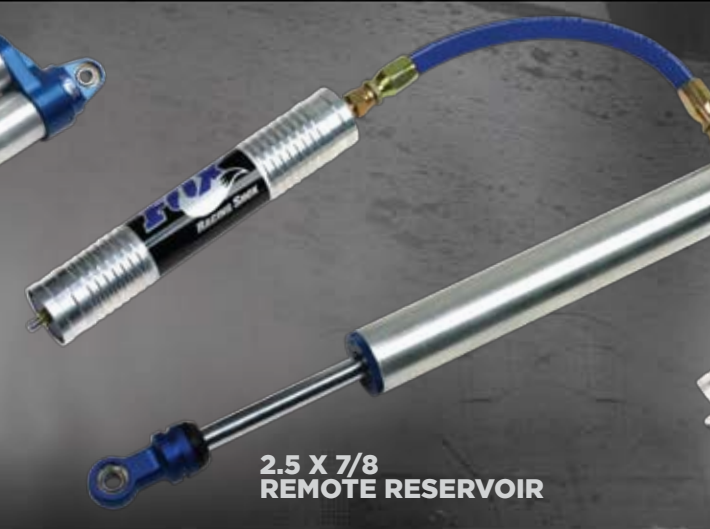
2.5 X 7/8 REMOTE RESERVOIR