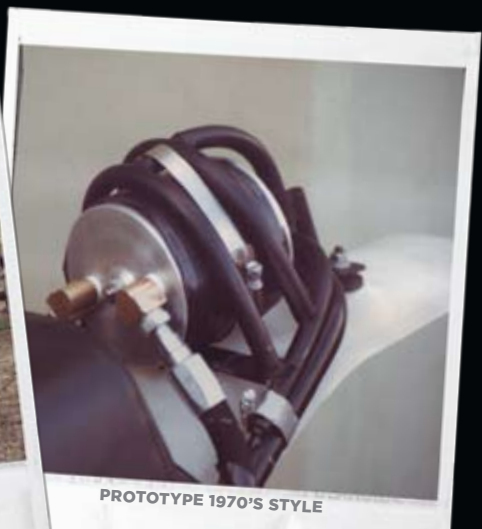
PROTOTYPE 1970'S STYLE