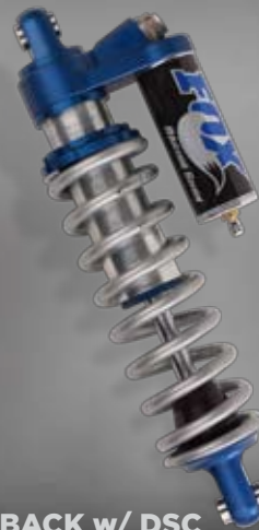
2.0 PIGGY-BACK w/ DSC