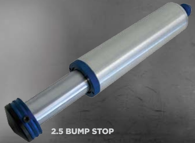
2.5 BUMP STOP