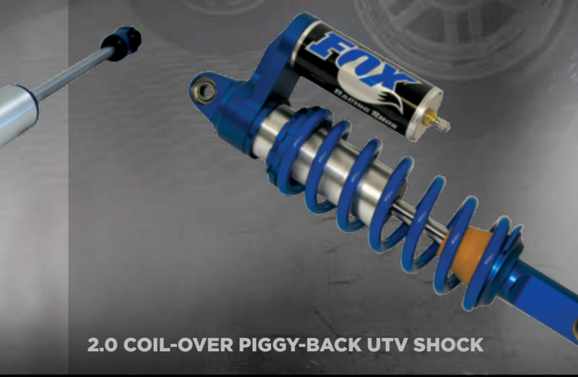
2.0 COIL-OVER PIGGY-BACK UTV SHOCK