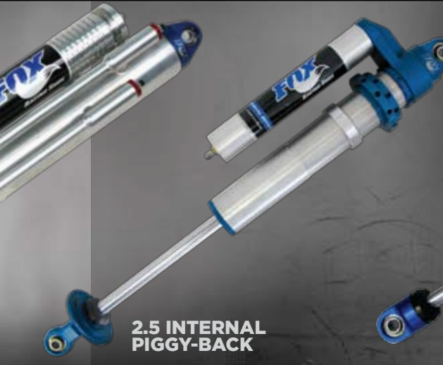
2.5 INTERNAL PIGGY-BACK