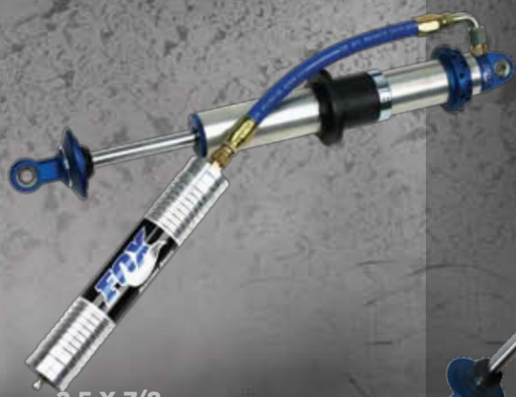
2.5 X 7/8 REMOTE RESERVOIR