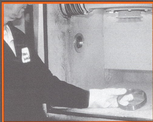
Thermostatically-controlled freezer units aid in the installation of tight-fitted cups in housings.

Use heat-resistant gloves to handle heated cones. Hold the hot cone solid against the cold shoulder on the shaft until the cone grabs on to the shaft. The hot cone will pull away from the cold shoulder unless it is held in position. Use feeler gauges to make sure the cone is fully seated against the shoulder after the parts are cooled. Many loose bearing settings (excessive end play) are caused by an unseated cone working back against the shoulder in service.