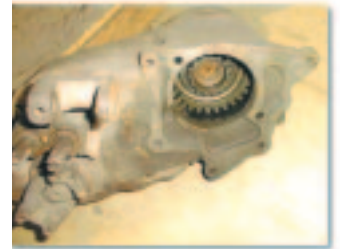
Large Hole transfer case (4")

All other Jeep transmissions were indexed to the transfer case by either a retainer housing or an index hub which was part of the stock transmission case. These transfer cases are classified as large hole transfer cases. Our adapters will require this indexing retainer to obtain proper alignment. This retainer can be purchased from us or you can also use a retainer from a Jeep T86 transmission. All large hole transfer cases require this retainer. (Scout Dana 300s are also a large hole transfer case). When utilizing either one of these retainers, we also recommend that a new 307 sealed bearing be used.