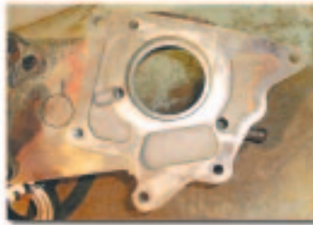
Small Hole transfer case (3-1/8")

INDEXING: The Dana Spicer transfer cases were indexed to the stock transmission by either a bearing or a bearing retainer. The early Jeeps that were equipped with the T90 or T84 transmissions used a bearing to index the transmission to transfer case. We classify this as a small hole transfer case. This small hole transfer case will require a bearing when you adapt to this transfer case. In addition to this bearing, our adapter will also require a thin bearing support retainer. This support retainer is necessary to align our adapter to the transfer case. This support retainer can be purchased from us or be obtained off of a stock T90 transmission.